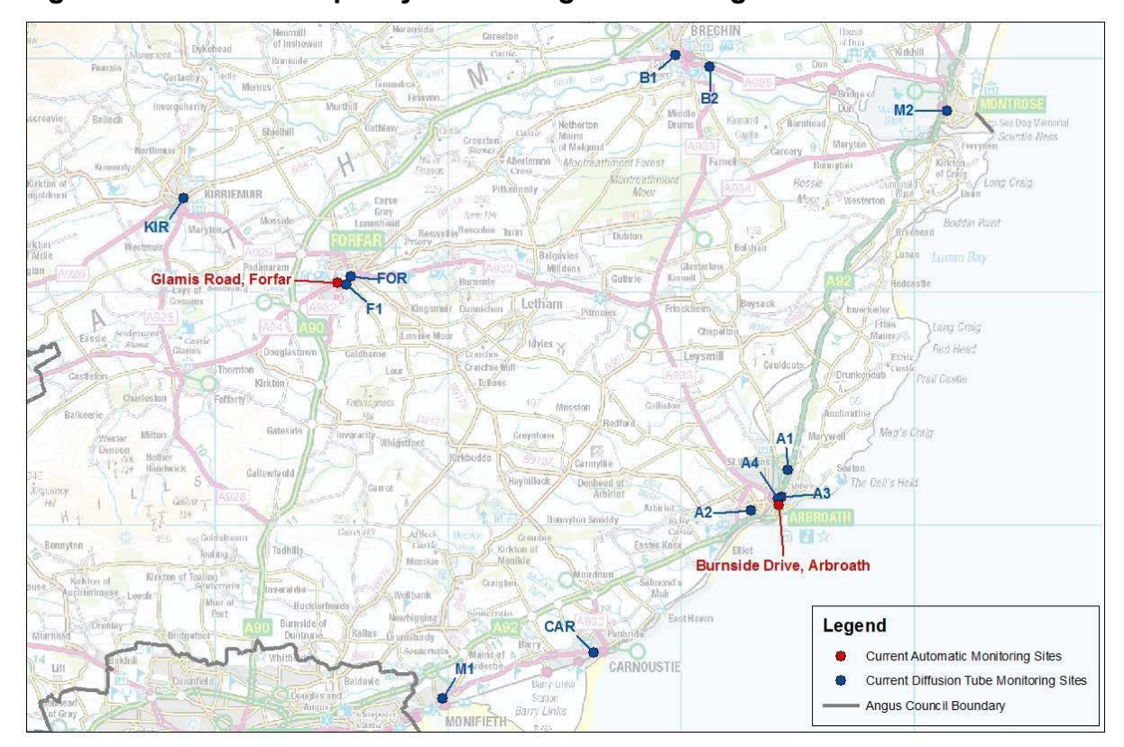
Figure 3-1 Current air quality monitoring sites in Angus

This section sets out the monitoring that has taken place in 2019, and how local concentrations of the measured pollutants compare with the objectives. The locations of the current monitoring sites are shown in Figure 3-1.