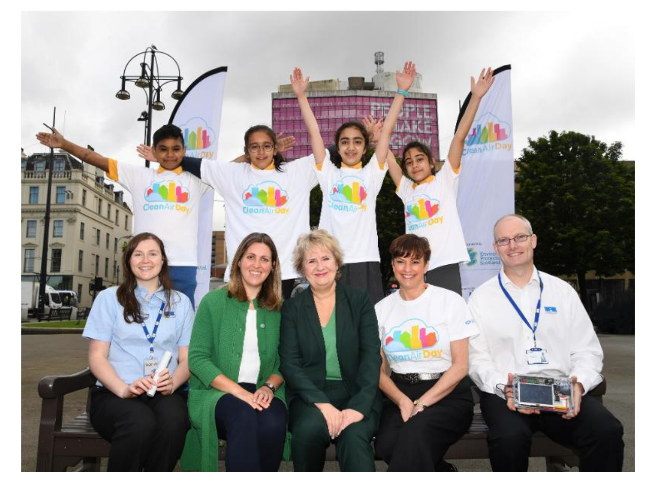
Clean Air Day 2019