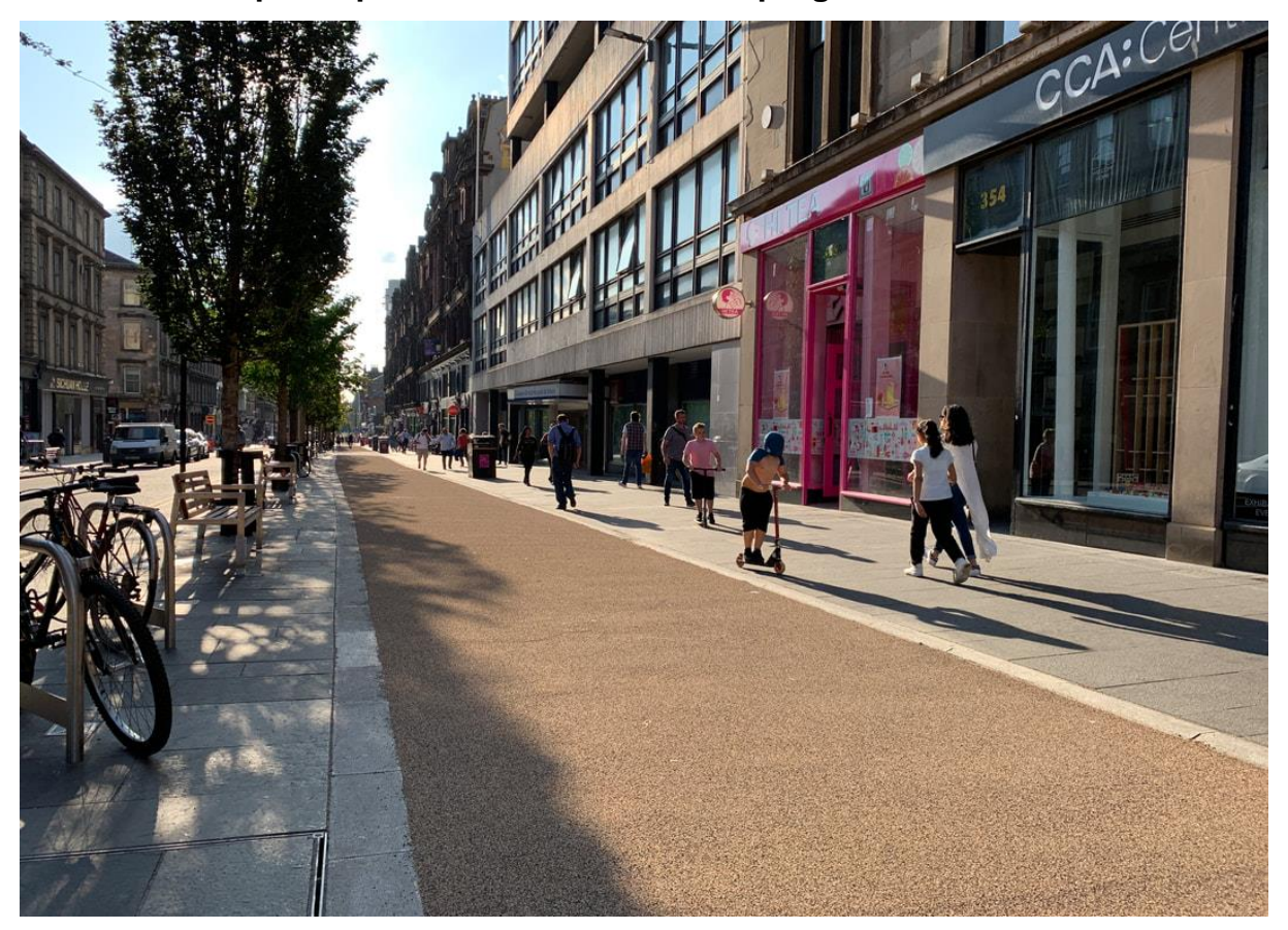
Sauchiehall St pre-implementation of Avenues program

Sauchiehall St on completion of Sauchiehall St West