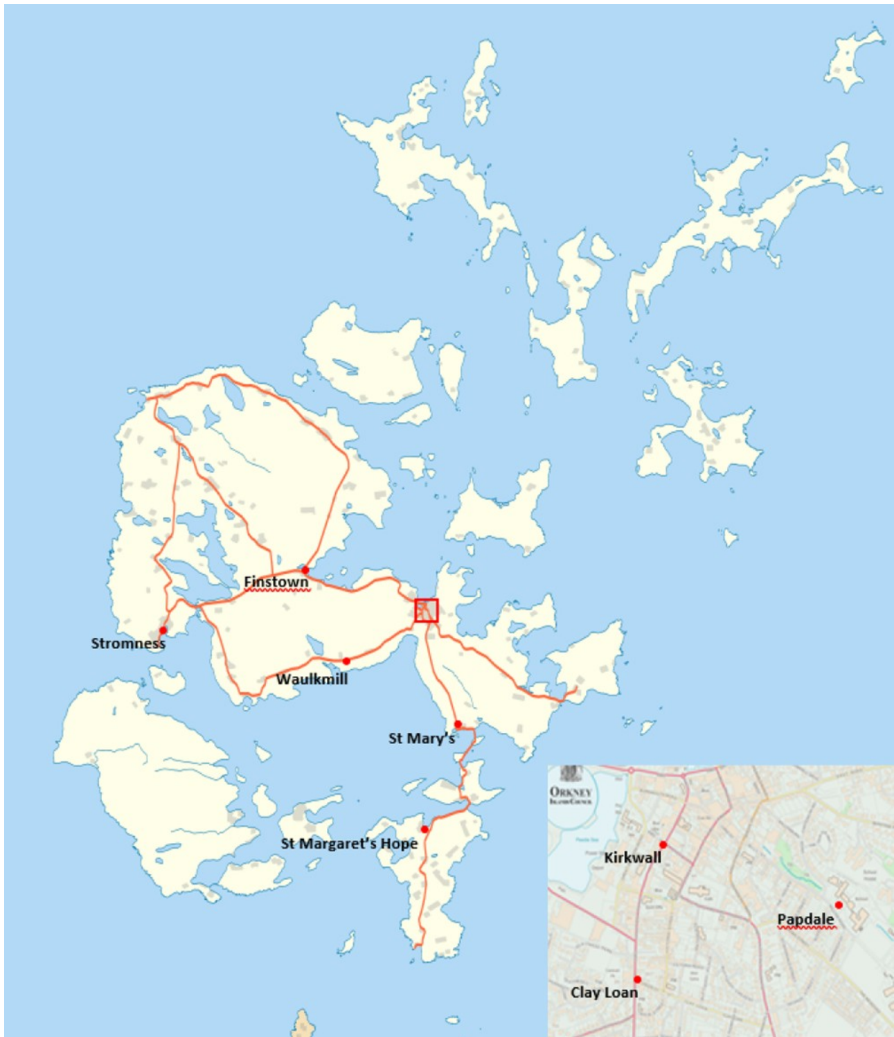
Figure D.1– Map of Diffusion tube locations across Mainland Orkney and the linked isles.